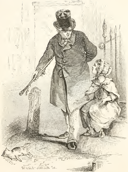
“Oh! my kitten,” sobbed Allie.”—Page 124.